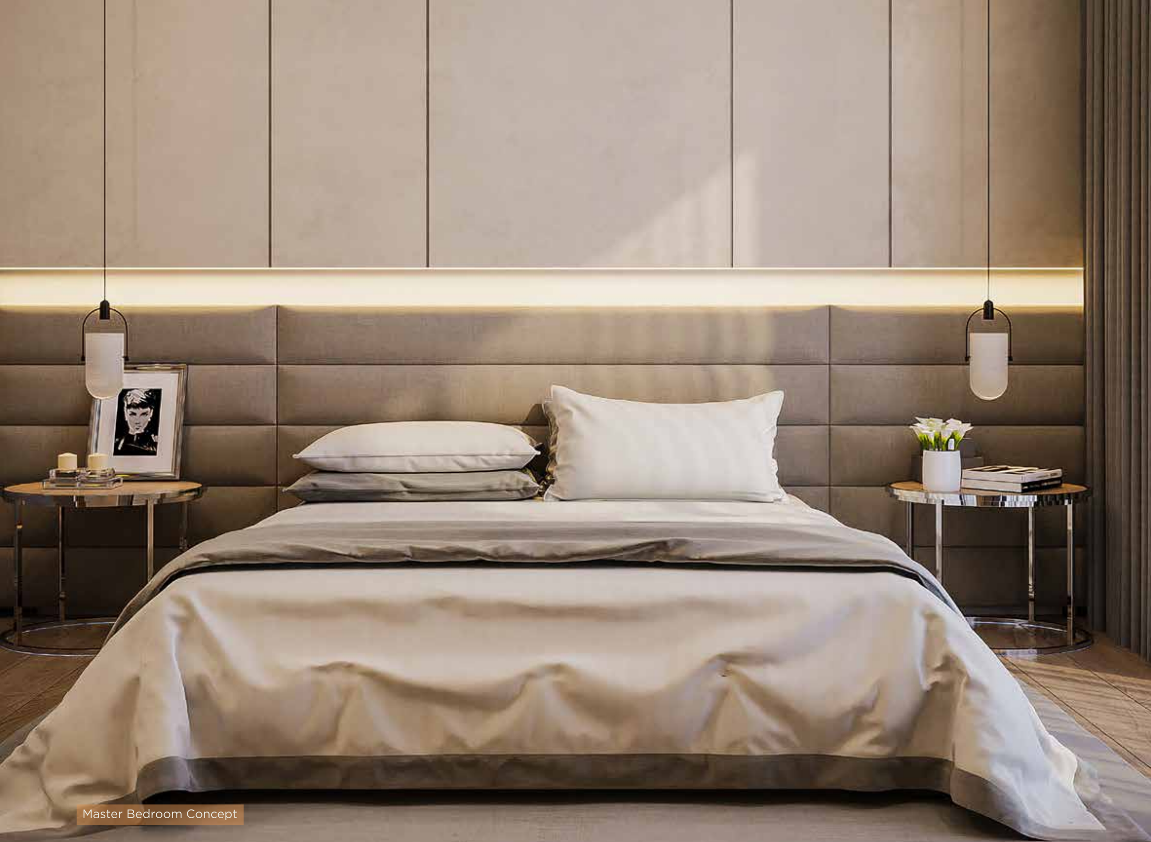
Master Bedroom Concept