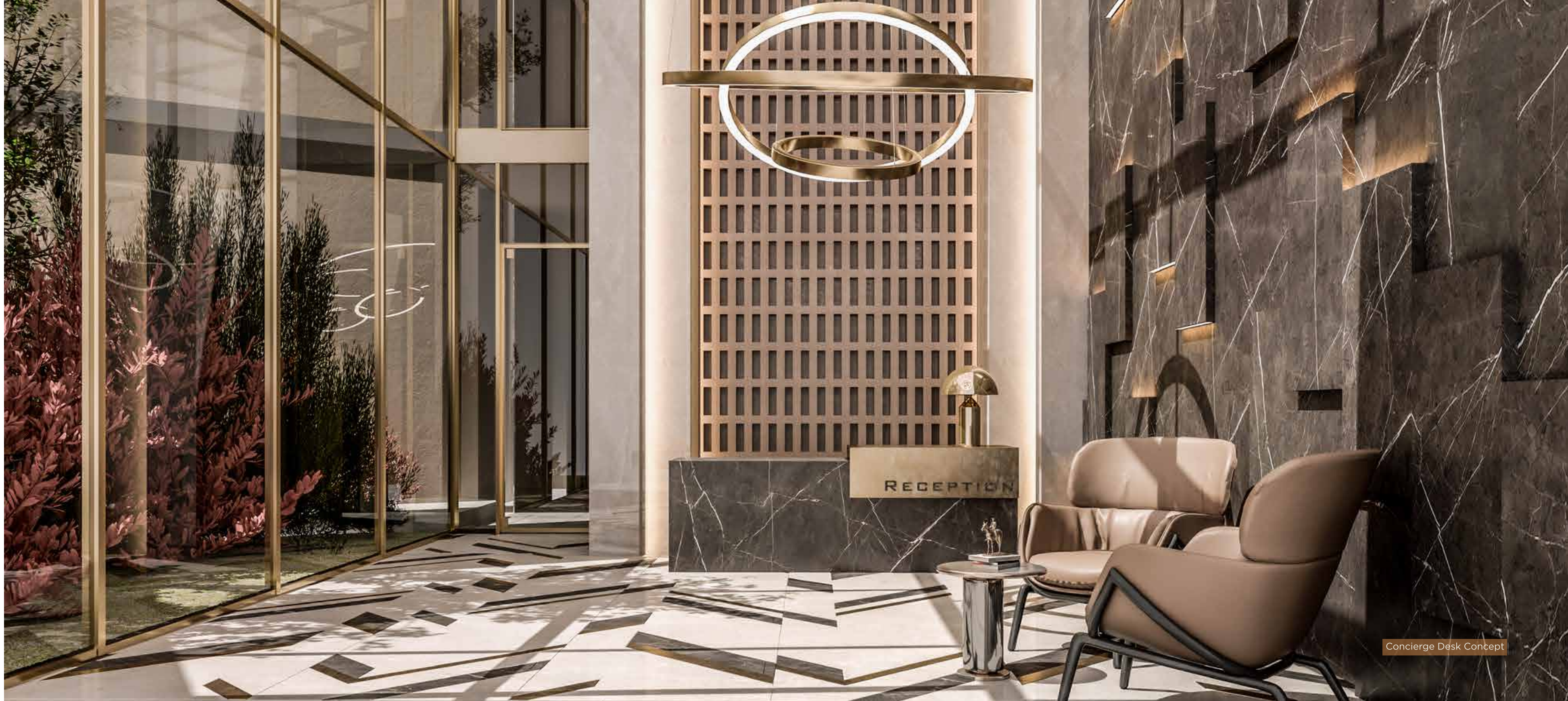
Concierge Desk Concept