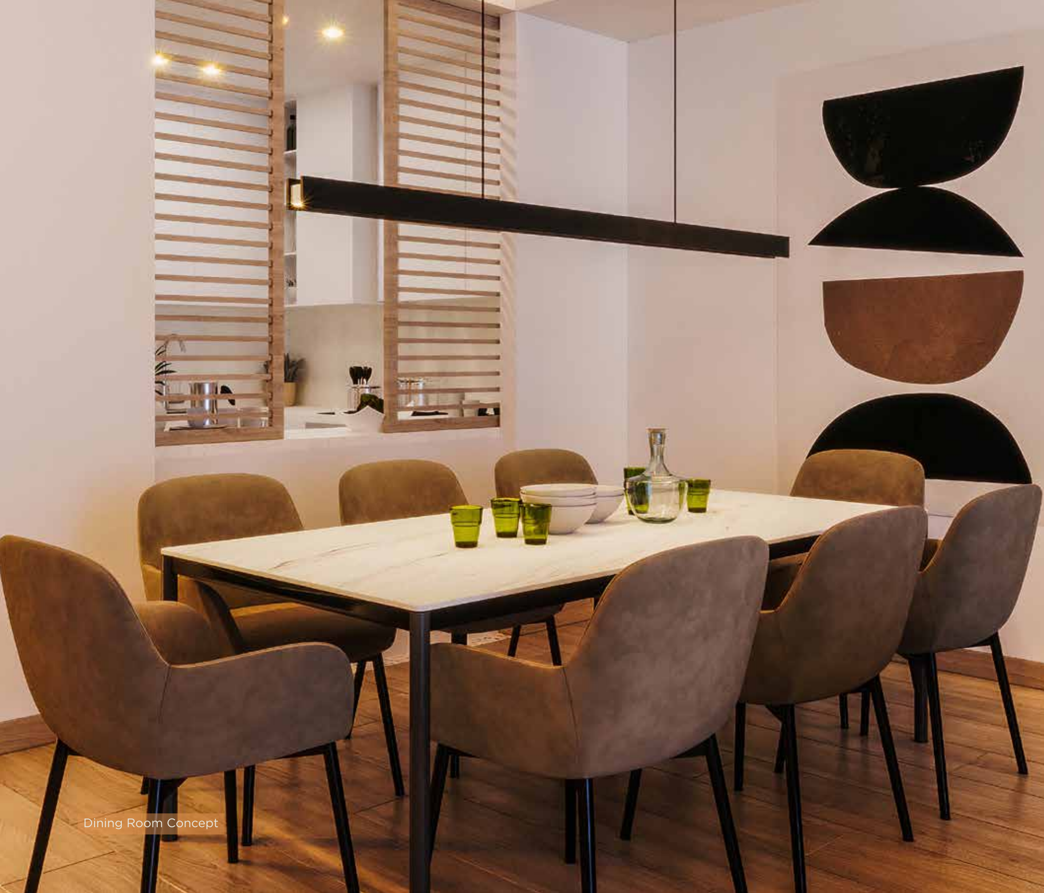
Dining Room Concept