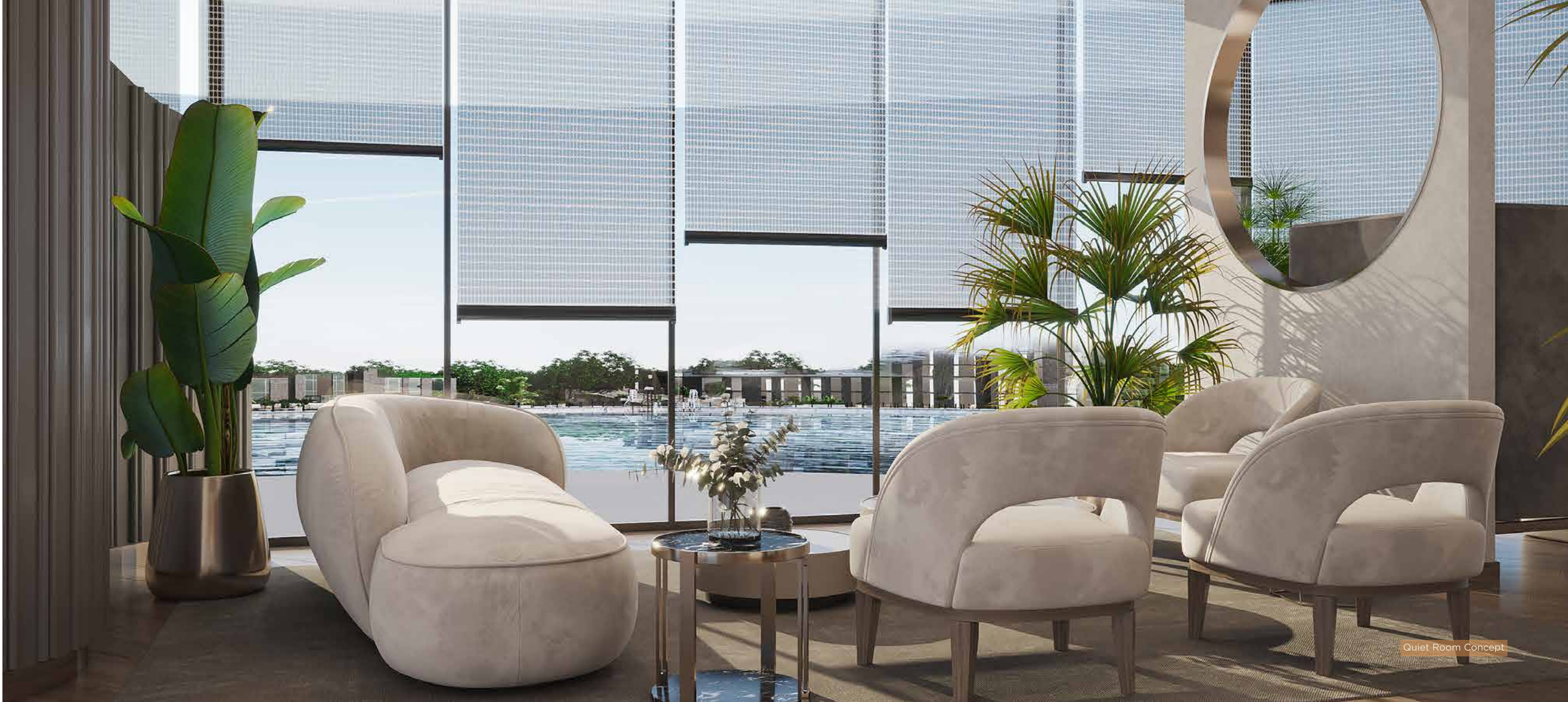
Quiet Room Concept