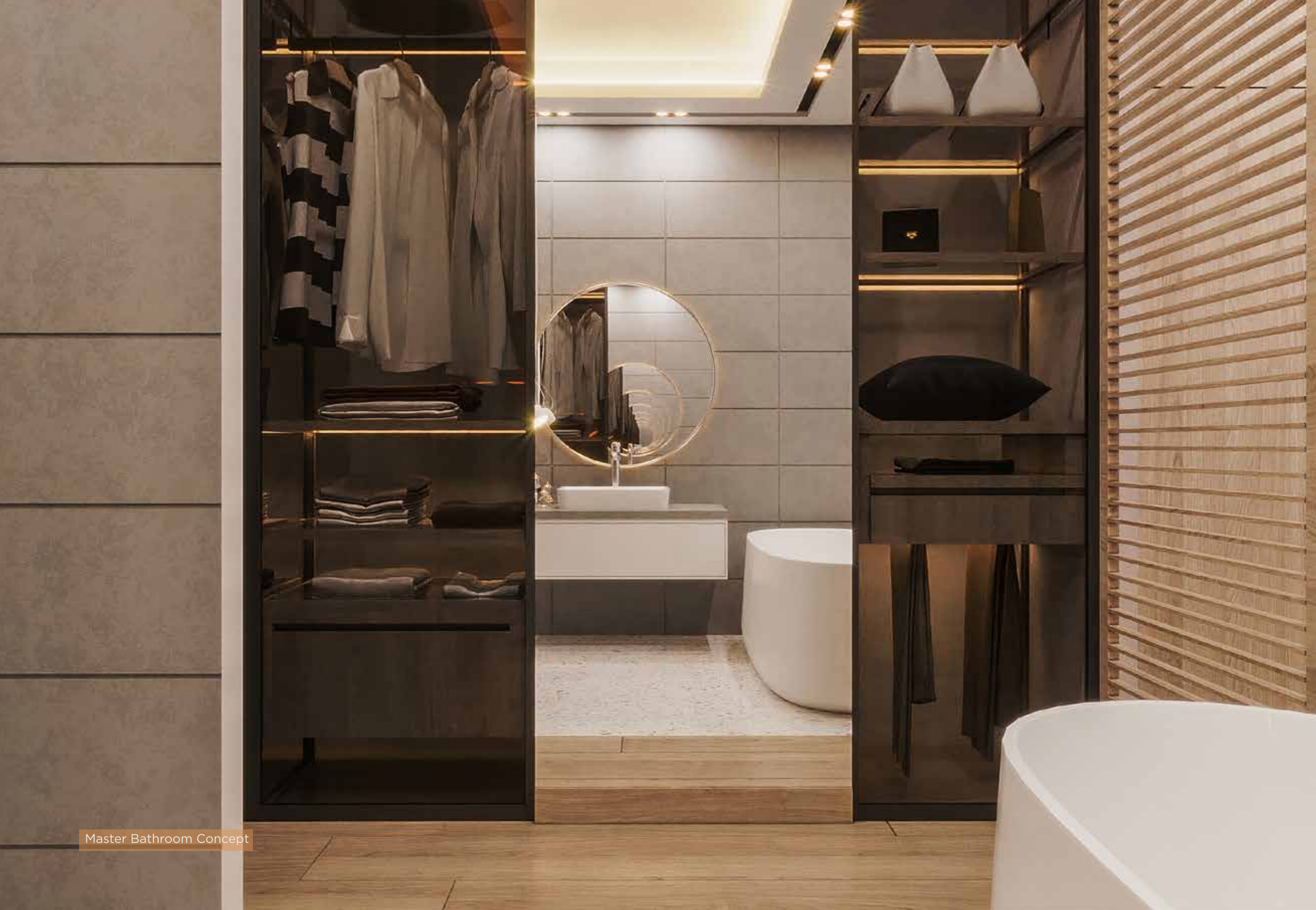
Master Bathroom Concept