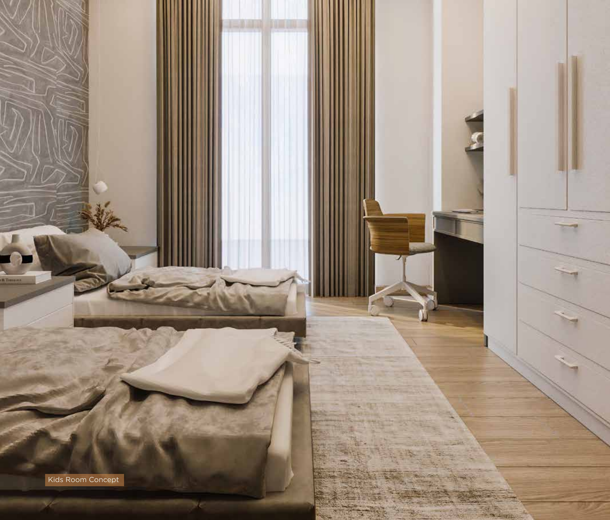
Kids Room Concept