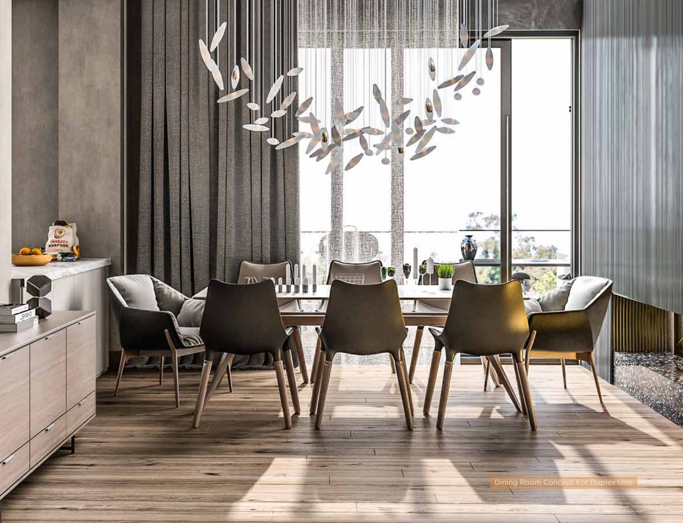
Dining Room Concept For Duplex Unit