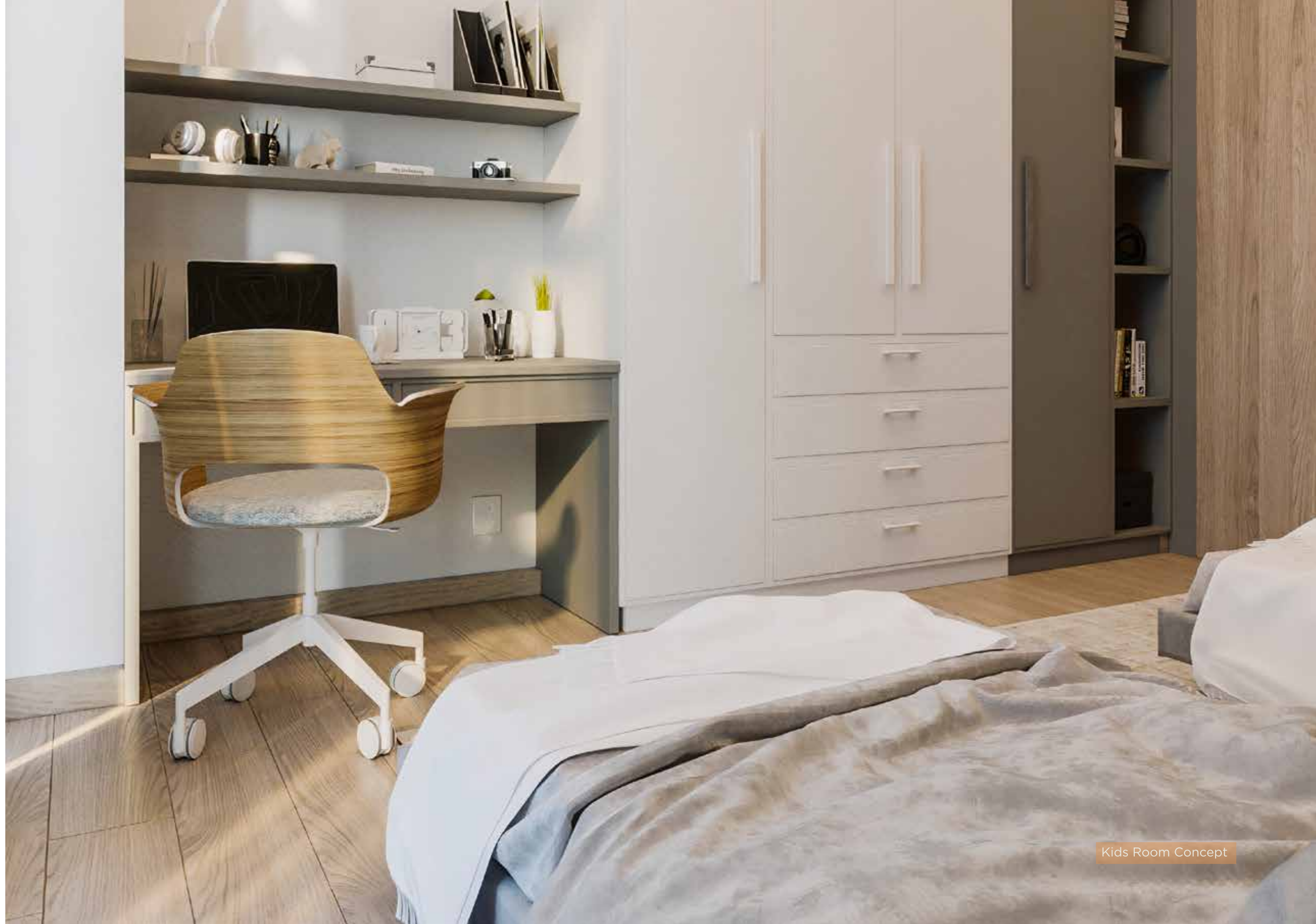
Kids Room Concept