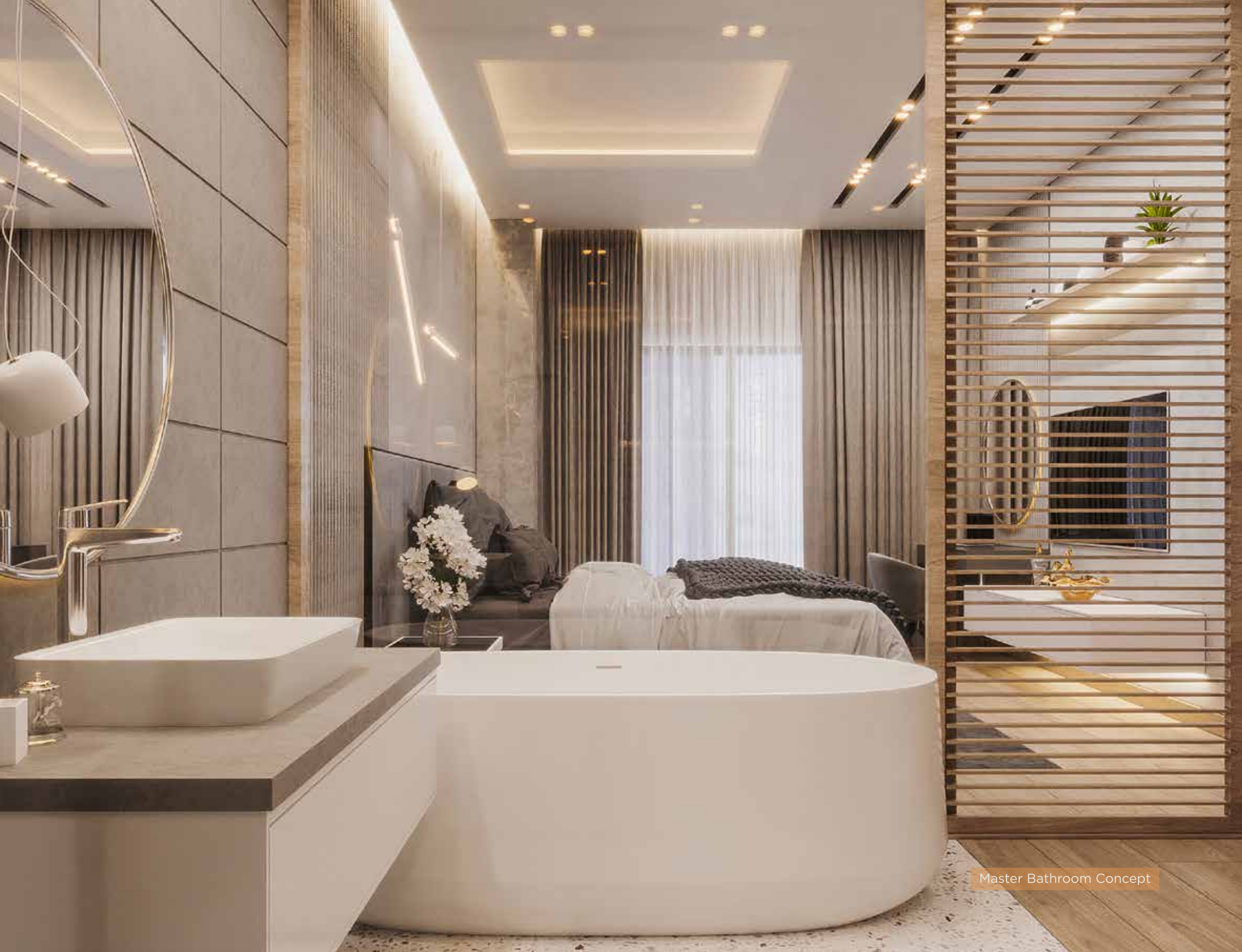
Master Bathroom Concept