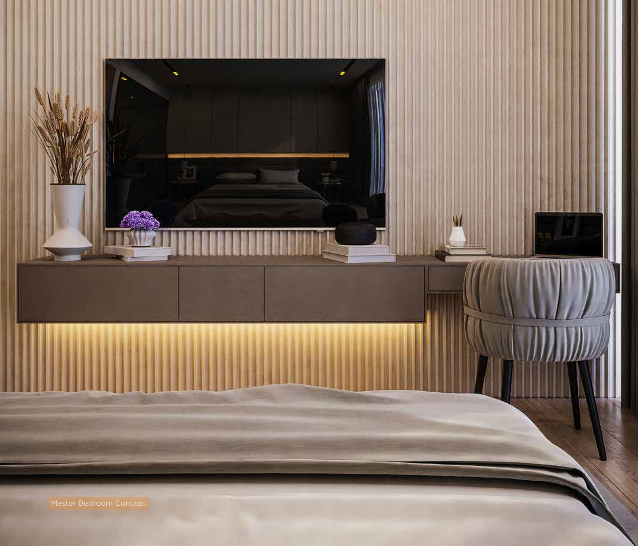
Master Bedroom Concept