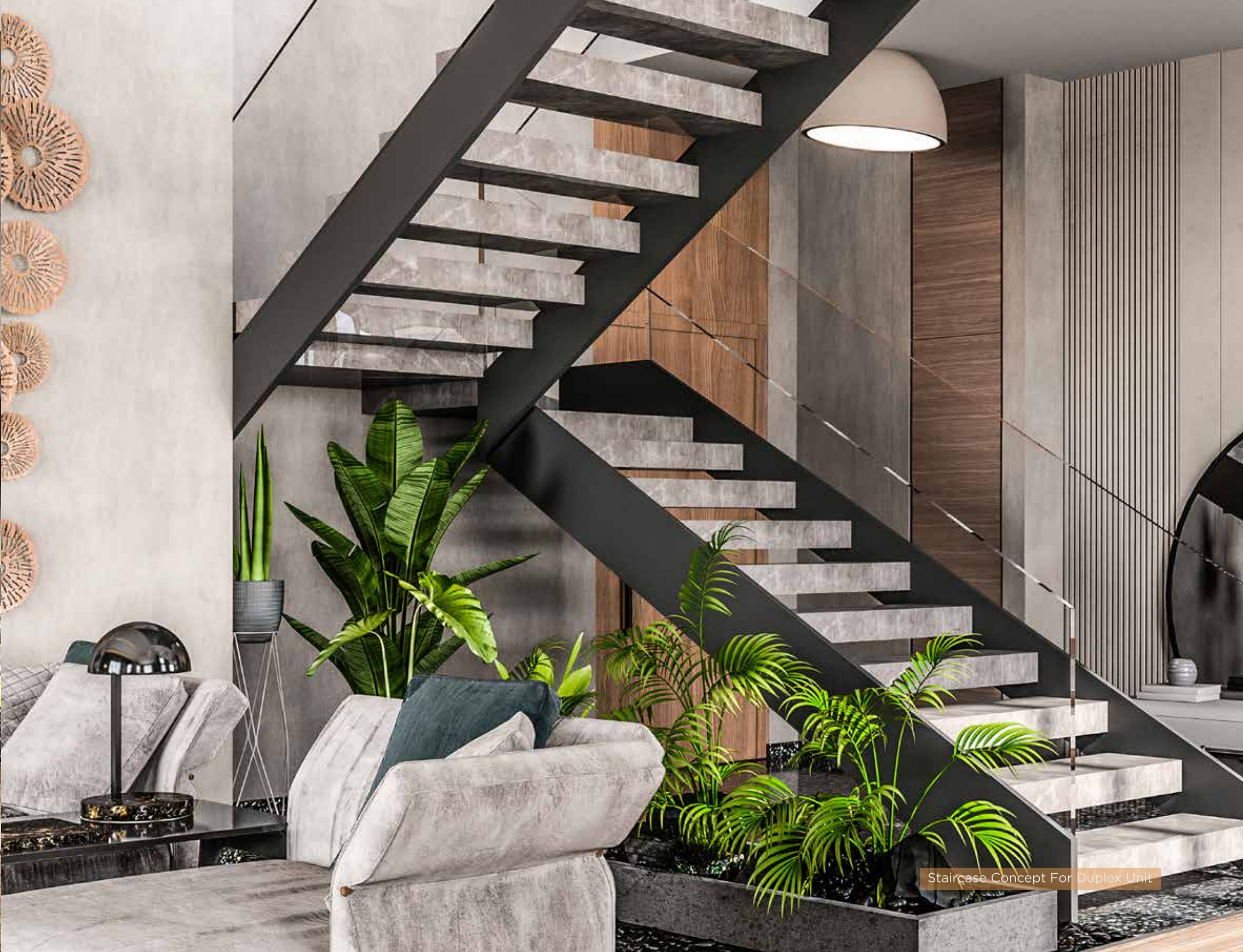
Staircase Concept For Duplex Unit