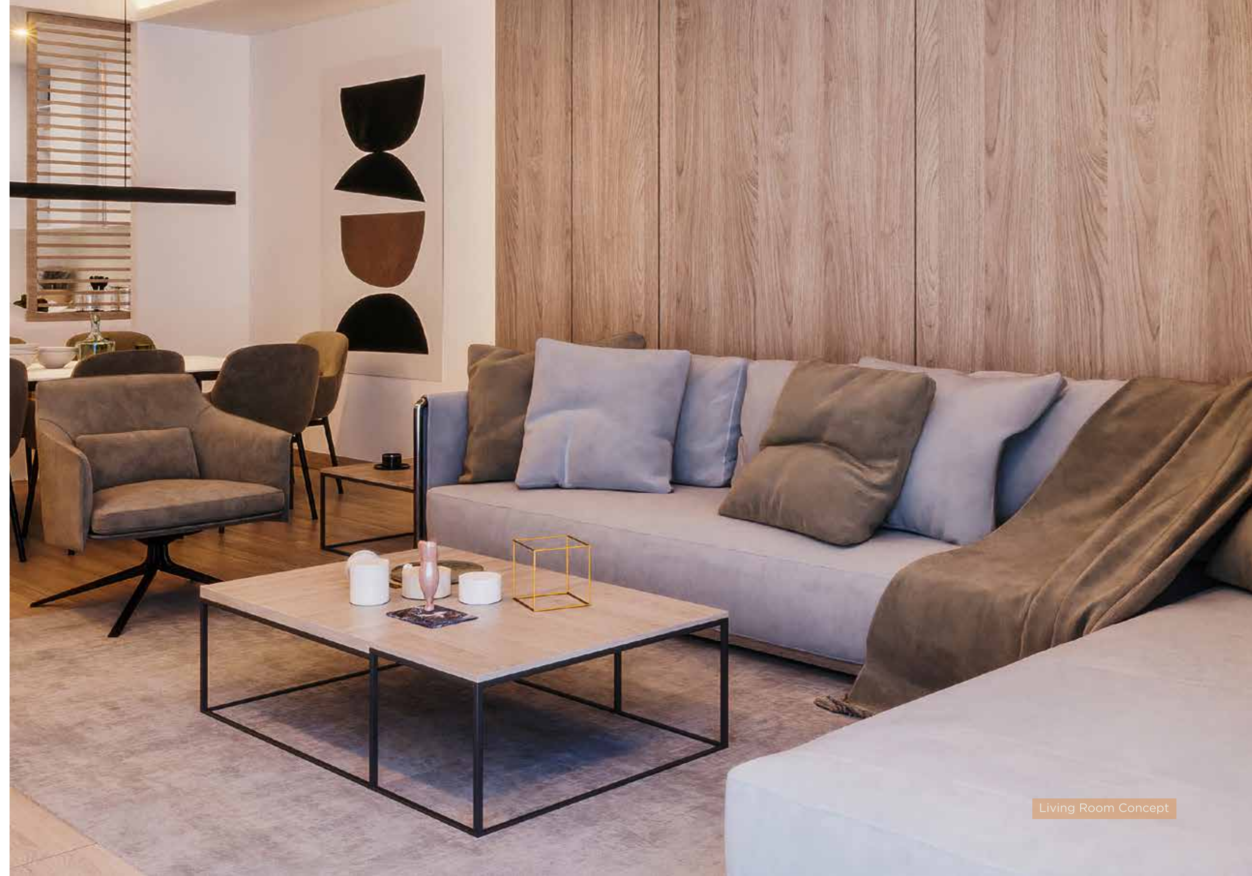
Living Room Concept