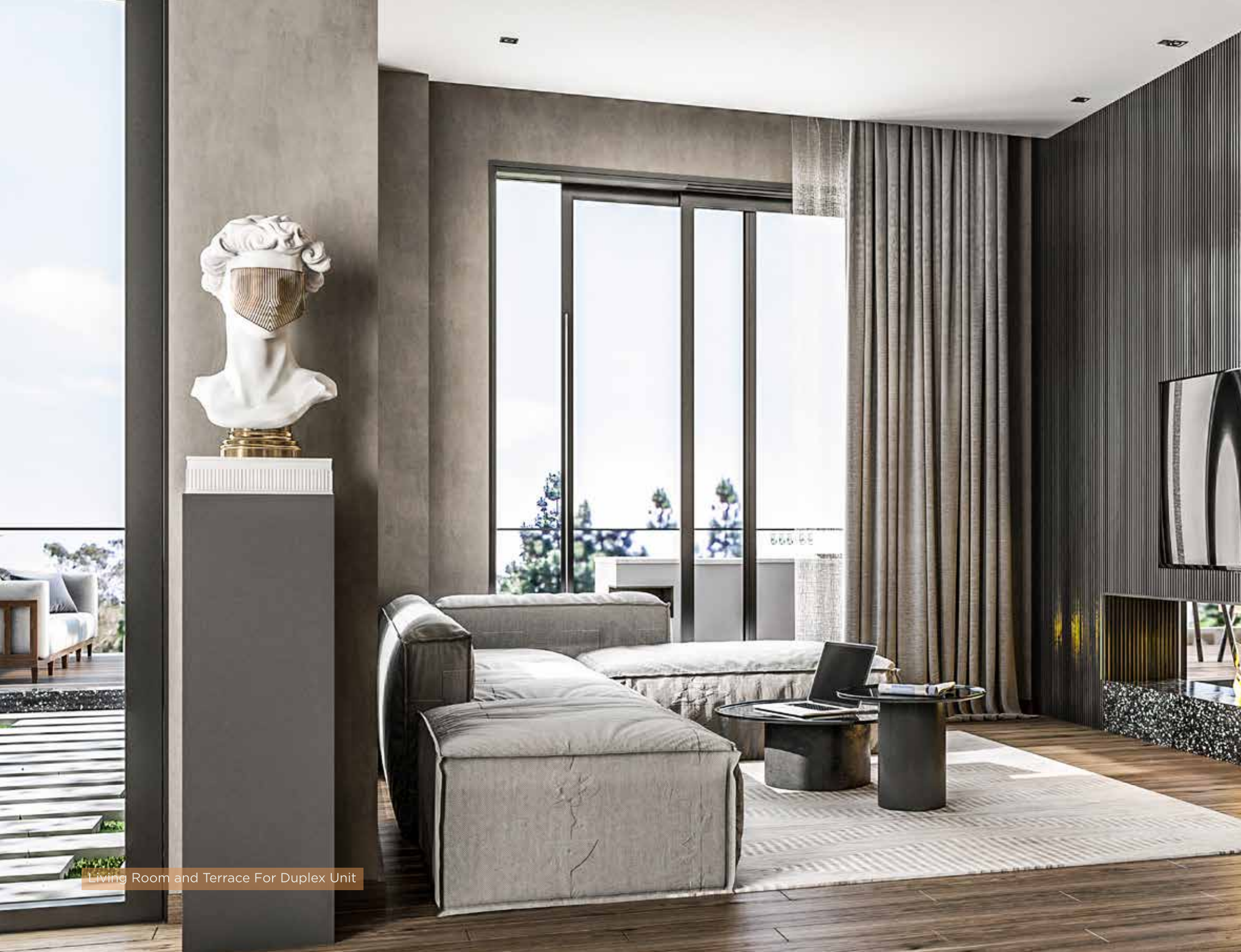
Living Room and Terrace For Duplex Unit