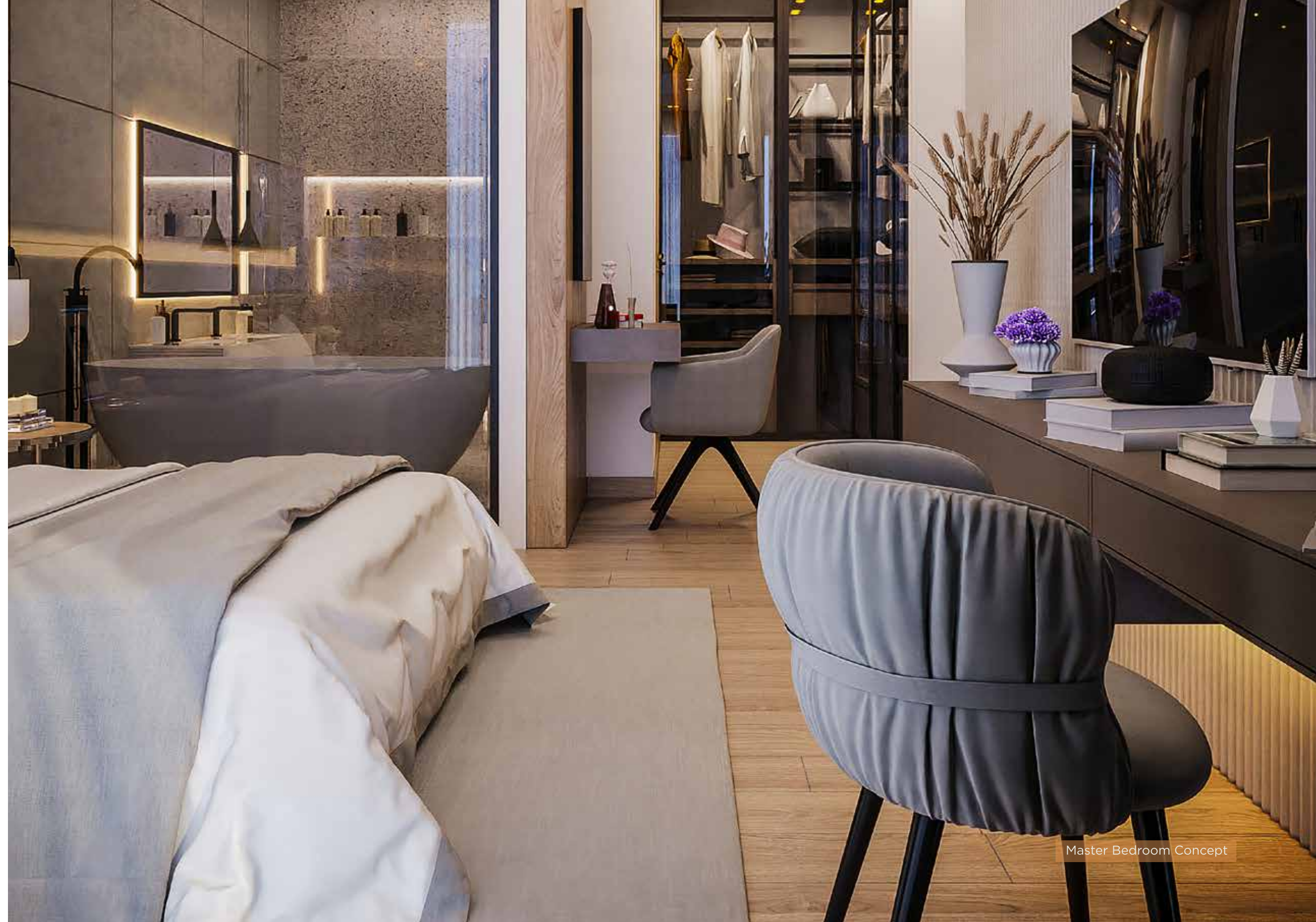
Master Bedroom Concept