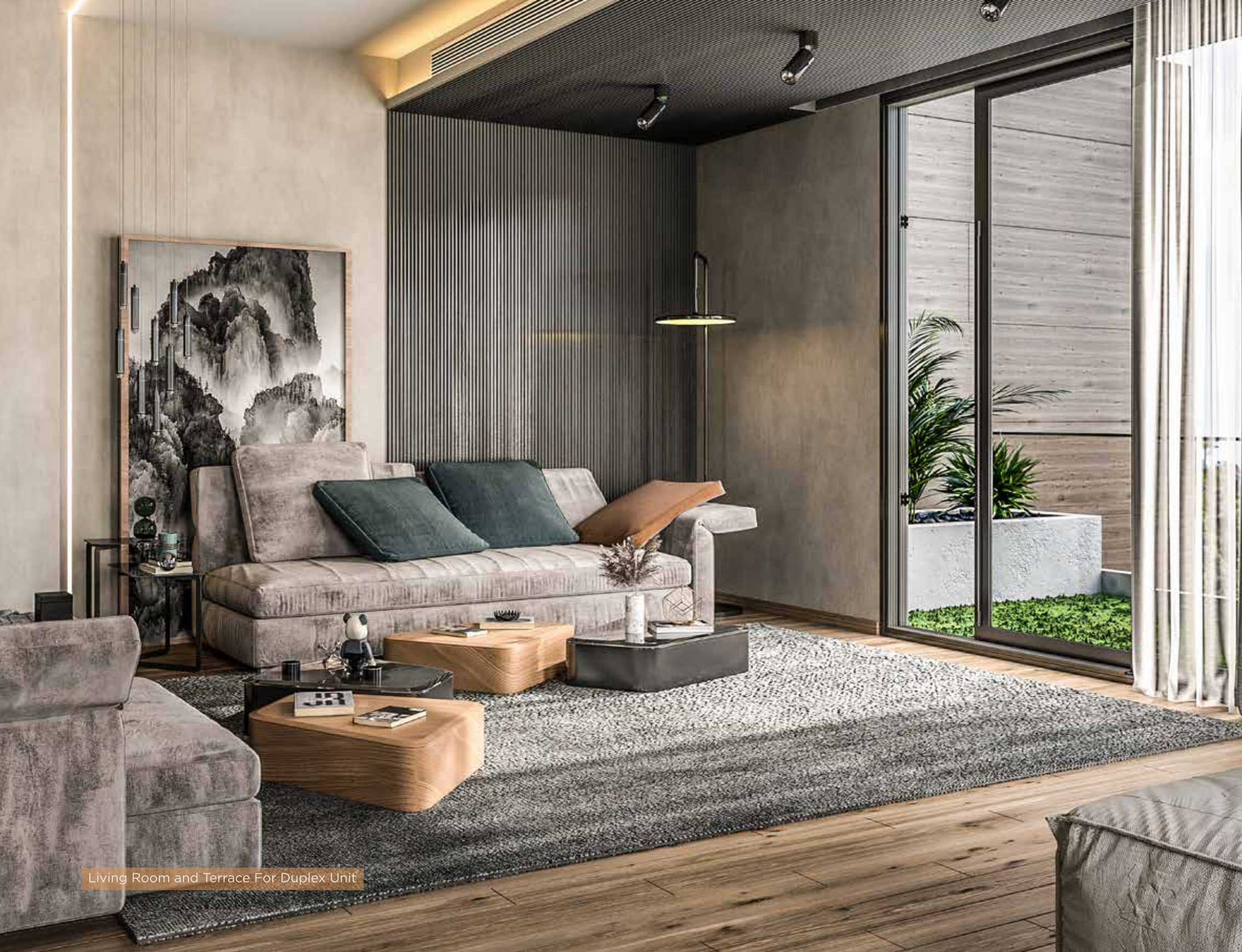
Living Room and Terrace For Duplex Unit