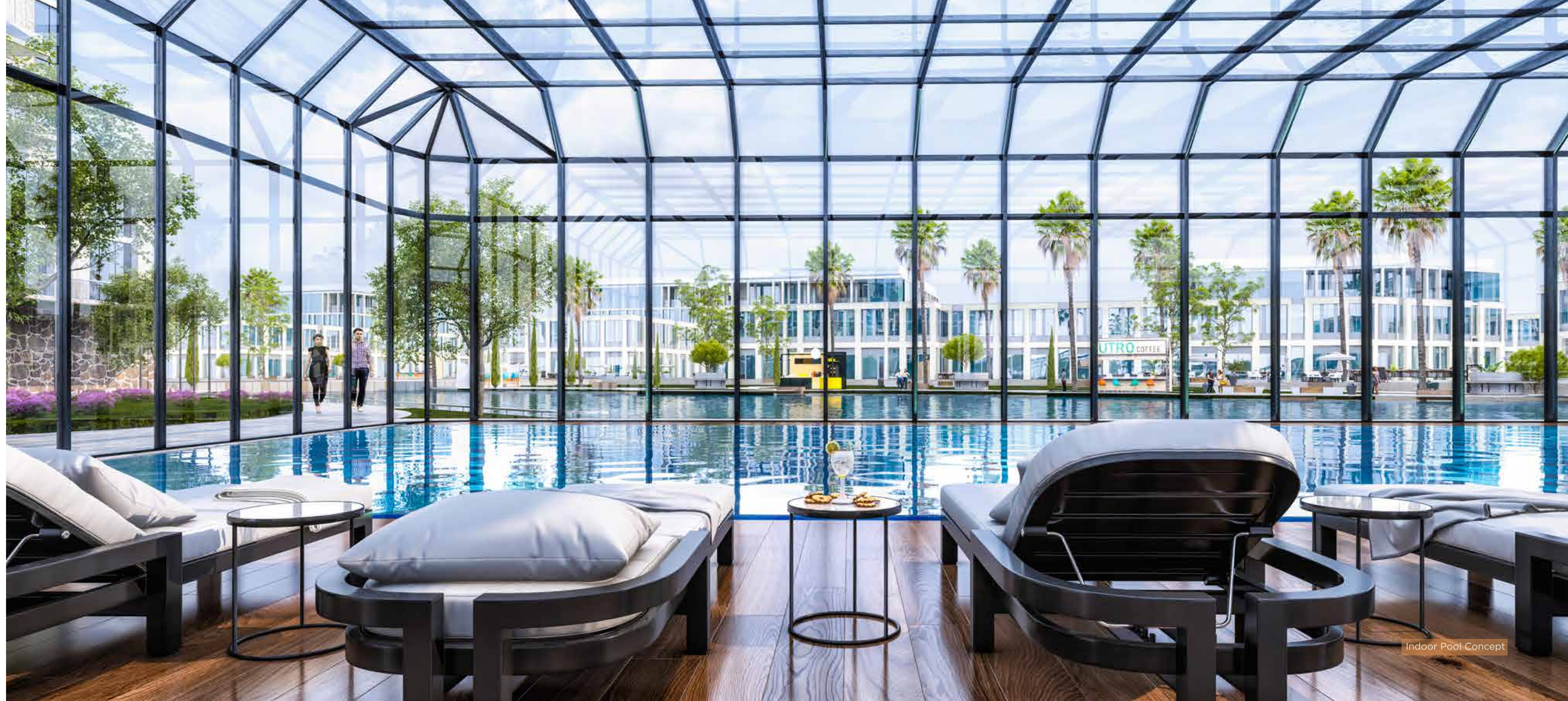
Indoor Pool Concept