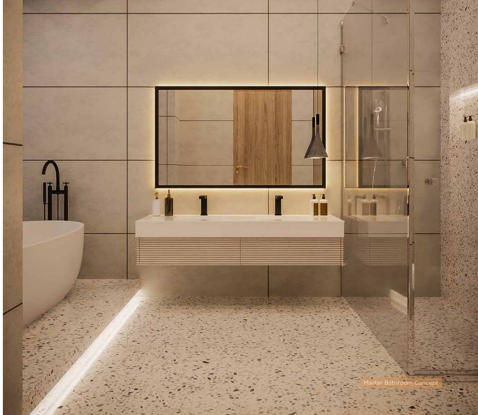
Master Bathroom Concept